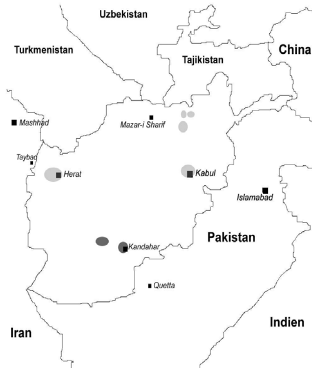
Fig.1: Mental map of Ghulam Ahmad – Status September 2006

Consequently, Ghulam Ahmad's mental map has changed over time. Kabul appears as a space of memory but the old man could not remember particular places and streets within the city. The former image has faded after not having been there for a long time. This lead to the conclusion that time and age are crucial aspects that strongly effect mental maps.